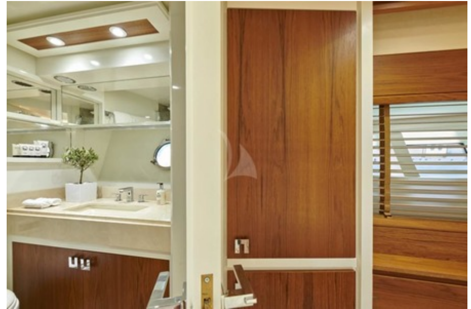
En Suite Facilities