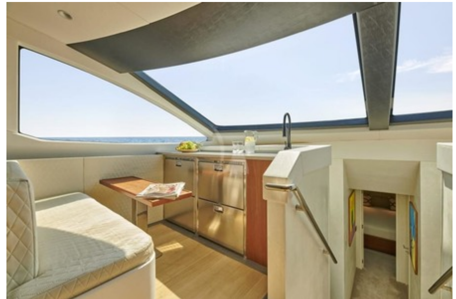
Wheelhouse Sitting Area