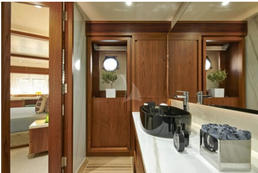
En Suite Facilities