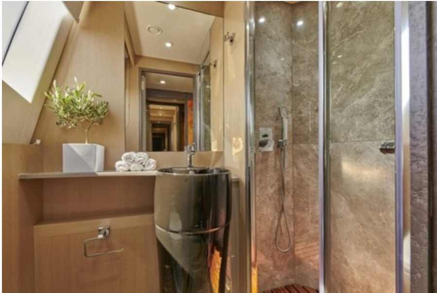
En Suite Facilities