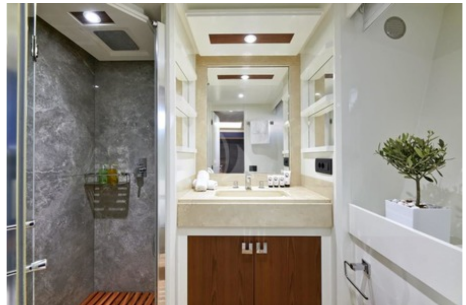
En Suite Facilities